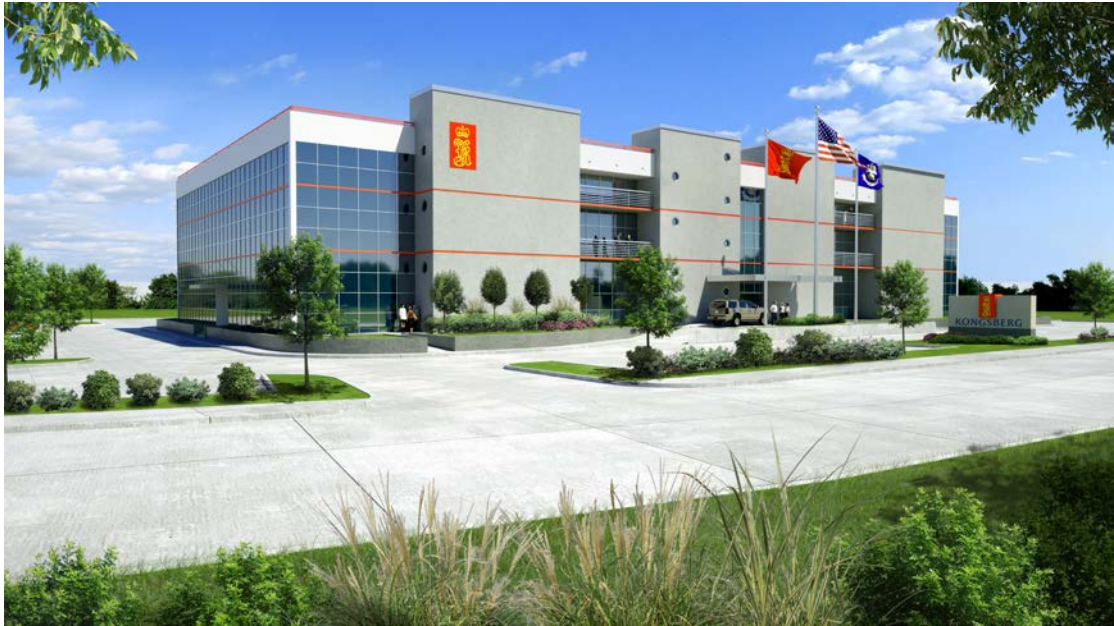
Kongsberg building rendering