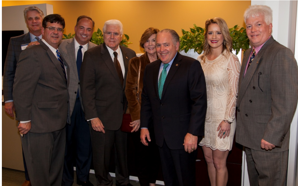
At the Adams & Reese Reception