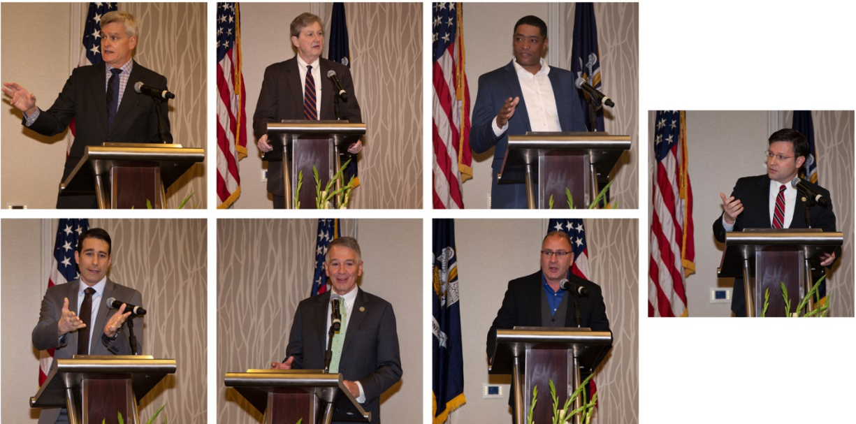
Louisiana's Congressional Delegation

Aucoin delivered the message: the importance of Ports. “Look at the amount of cargo that passes through the nation’s port system,” he said. “In 2017, over 307 million short tons of cargo passed within the Port of South Louisiana alone! It’s a number that’s projected to increase as the $23.262 billion of announced capital investment begins to come online. We must do everything in our power to maintain the health of our maritime infrastructure which includes dredging the mouth of the Mississippi River, which is crucial to our economic growth.”